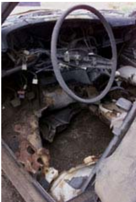
The American Survivor